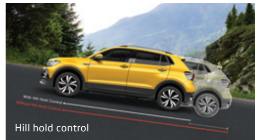
Hill hold control