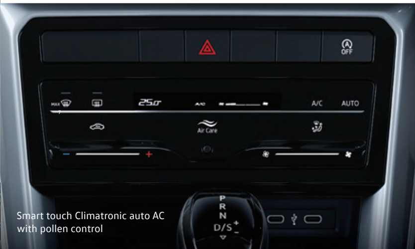
Smart touch Climatronic auto AC with pollen control