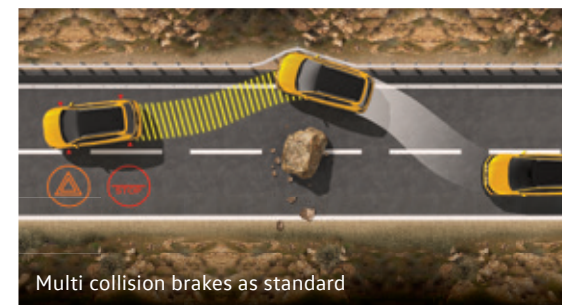
Multi collision brakes as standard