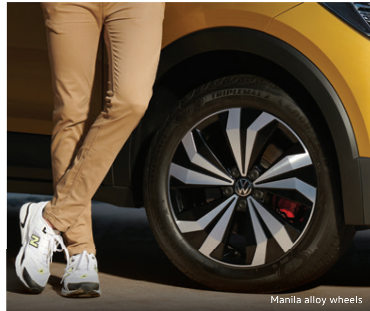
Manila alloy wheels