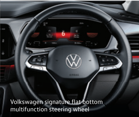
Volkswagen signature flat bottom multifunction steering wheel

The intuitive and thoughtful Taigun helps you play smart to stay ahead in the hustle. The Volkswagen signature flat bottom multi-function steering wheel allows you stay on top of all that drives you ahead. While the Smart touch Climatronic AC and the ventilated seats set the temperature and keep you comfortable in any condition.