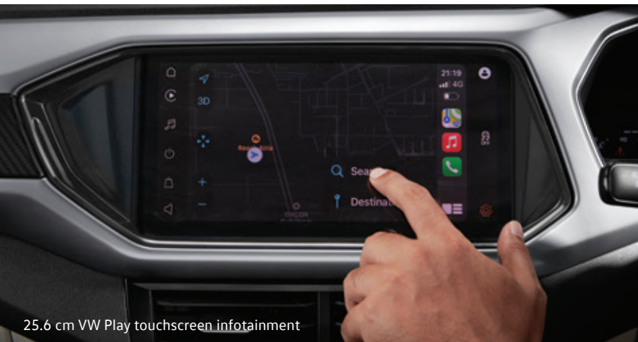
25.6 cm VW Play touchscreen infotainment

When it comes to technology, the Taigun is one step ahead. With the largest-in-segment 20.32 cm Digital cockpit, the Taigun always gives you an insight about your driving style. While the 25.6 cm VW Play touchscreen infotainment ensures that you stay connected to the hustle.