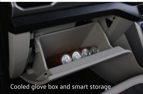
Cooled glove box and smart storage