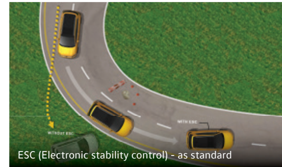
ESC (Electronic stability control) - as standard