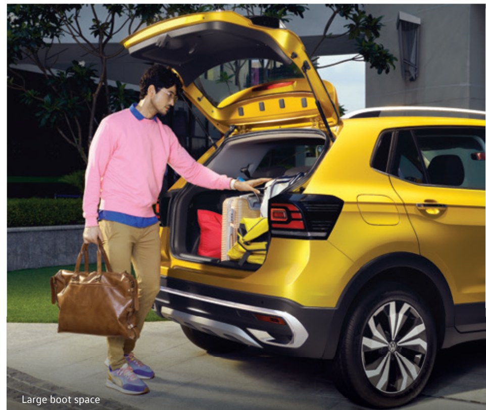
Large boot space

Once inside, the Taigun sets the mood for your hustle, with its sporty ambient lighting. The Dual tone premium interiors are designed by and for those with an eye for detail. The carbon finish complements the sporty look, while the massive boot space lets you accommodate a lot more in your everyday hustle.