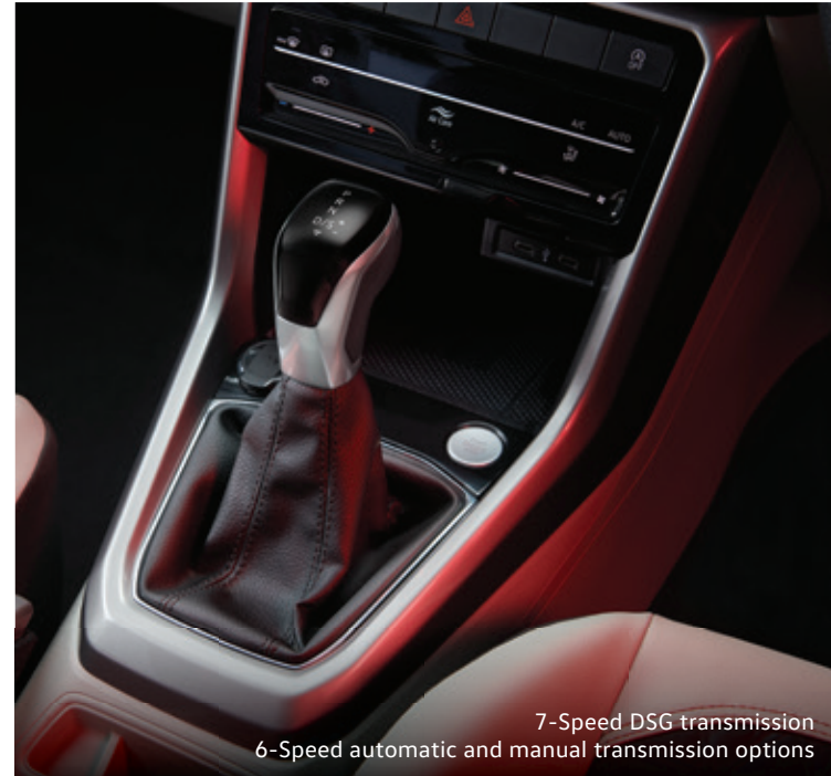
7-Speed DSG transmission 6-Speed automatic and manual transmission options

The thrill of hustle is in the chase of perfection. With the revolutionary TSI engine at its heart, the Taigun brings to the race, unabashed power combined with thoughtful efficiency. The 1.0 TSI engine available with manual and automatic transmission options, and the 1.5 TSI engine that comes with manual and DSG transmission options, lets you pick the best combination to set the pace for every chase. The Manila alloy wheels provide that edge to complement the Taigun's performance.