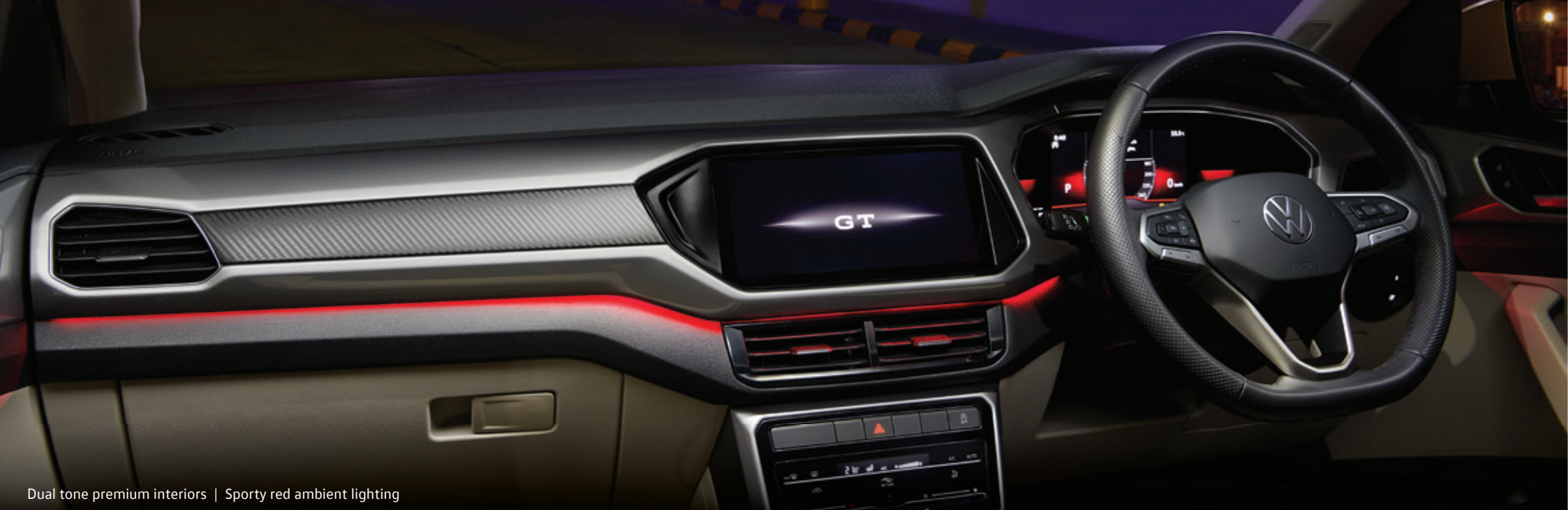
Dual tone premium interiors | Sporty red ambient lighting