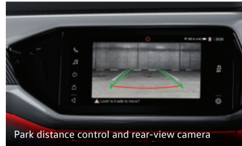
Park distance control and rear-view camera