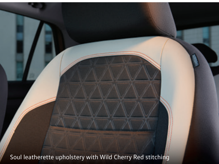
Soul leatherette upholstery with Wild Cherry Red stitching

Once inside, the Taigun sets the mood for your hustle, with its sporty ambient lighting. The Dual tone premium interiors are designed by and for those with an eye for detail. The carbon finish complements the sporty look, while the massive boot space lets you accommodate a lot more in your everyday hustle.