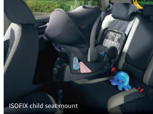
ISOFIX child seat mount