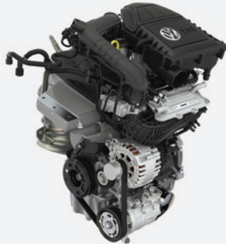
1.0 TSI engine