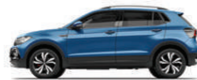
RISING BLUE METALLIC