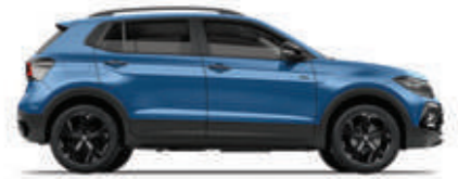
RISING BLUE METALLIC