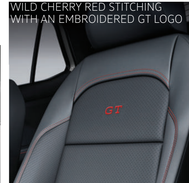
WILD CHERRY RED STITCHING WITH AN EMBROIDERED GT LOGO