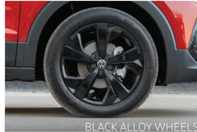
BLACK ALLOY WHEELS