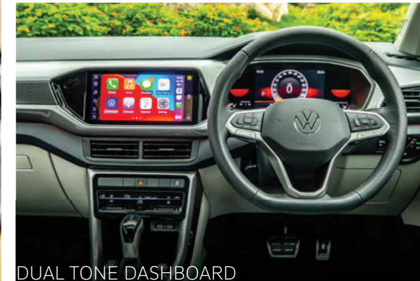
DUAL TONE DASHBOARD