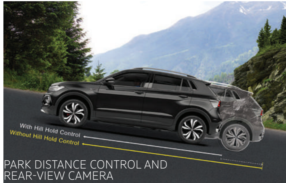
PARK DISTANCE CONTROL AND REAR-VIEW CAMERA