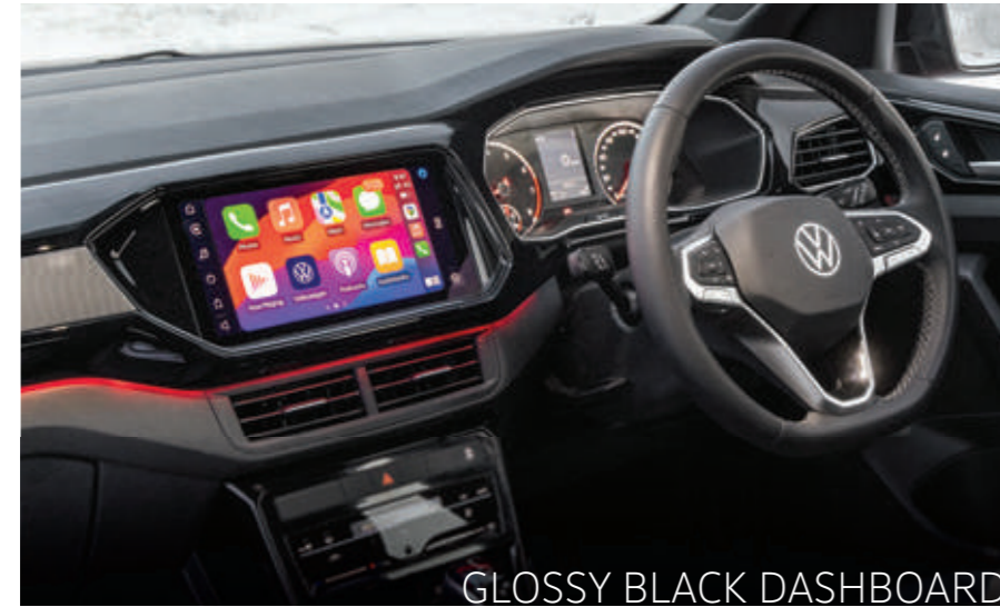
GLOSSY BLACK DASHBOARD