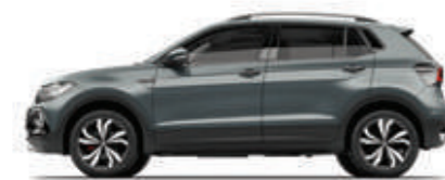
CARBON STEEL GREY