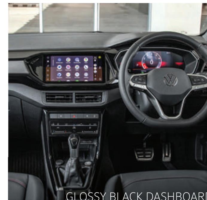
GLOSSY BLACK DASHBOARD