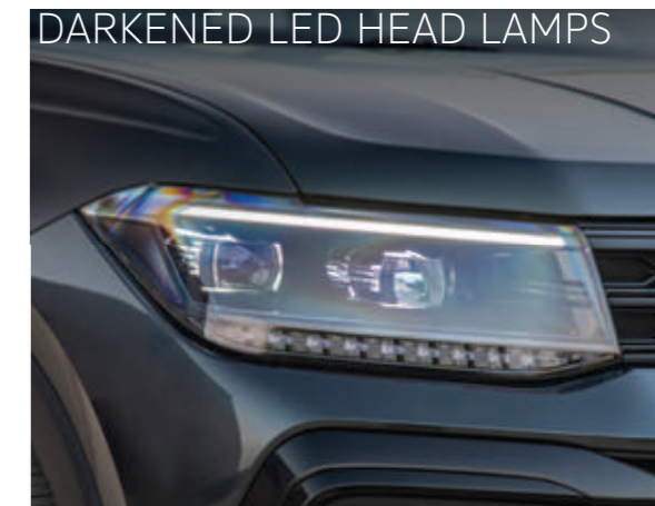
DARKENED LED HEAD LAMPS