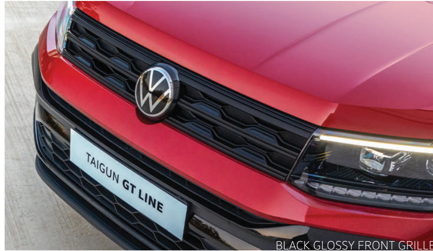
BLACK GLOSSY FRONT GRILLE