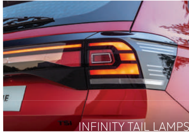
INFINITY TAIL LAMPS