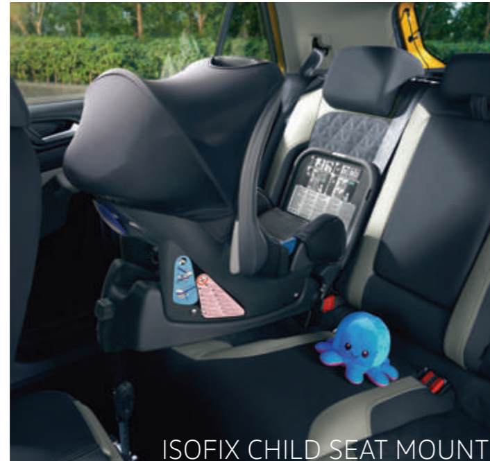
ISOFIX CHILD SEAT MOUNT

When you're in a Taigun, you worry less about your safety and more about which song to play next. Awarded the prestigious 5-star Global NCAP safety rating for adult and child occupants, the Taigun comes anointed with 40+ safety features such as up to 6 airbags for driver and passengers, 3-point seatbelts for all occupants, Hill Hold Control, Traction Control, Park Assist with Rear Camera and Electronic Stability Control (ECS) that detects critical situations and prevents skidding, bringing peace of mind to every drive. Phew.