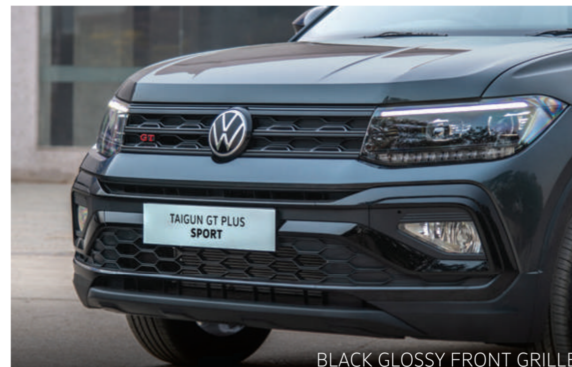
BLACK GLOSSY FRONT GRILLE