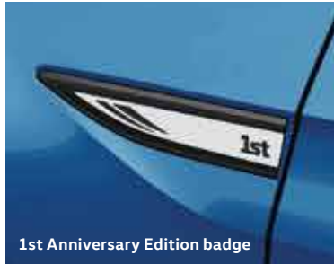
1st Anniversary Edition badge