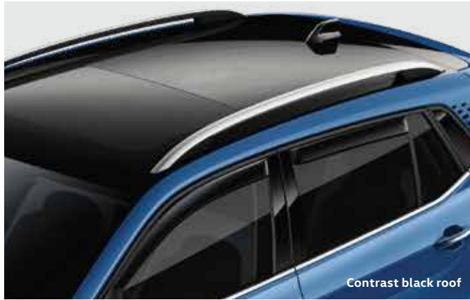
Contrast black roof