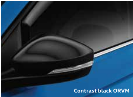
Contrast black ORVM