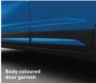
Body coloured door garnish