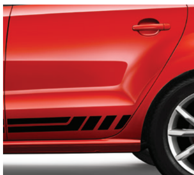
SIDE BODY GRAPHICS

The legend has a lot of followers. Make it worth their time with a sleek boot badge.