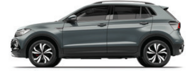
CARBON STEEL GREY