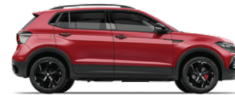
WILD CHERRY RED