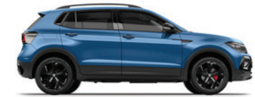
RIISING BLUE METALLIC