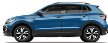
RISING BLUE METALLIC