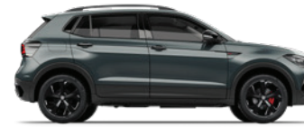
CARBON STEEL GREY