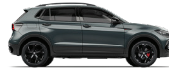
CARBON STEEL GREY