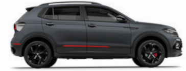
CARBON STEEL GREY MATTE