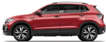
WILD CHERRY RED

GT is more than just a badge, it's a testament to the top-notch German-engineering and powerful performance of Taigun. The striking, bold design makes a statement with Chrome plaque with GT branding on the front fender, grille, and rear; GT welcome message on infotainment, Laser Red Ambient Lighting, Wild Cherry Red Stitching, Amrur Grey Classy Décor, Red Painted Caliper in Front, R17 Manila Alloy Wheels in dual tone and Dual tone leatherette seat upholstery with Red stitching.