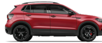
WILD CHERRY RED