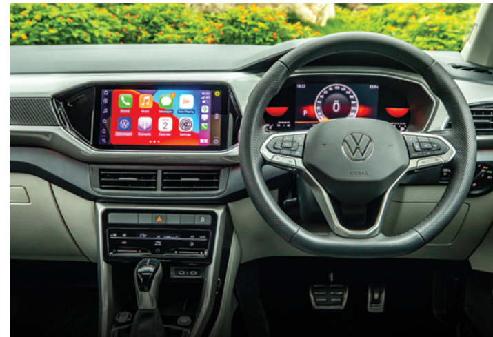
DUAL TONE DASHBOARD