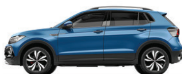
RISING BLUE METALLIC