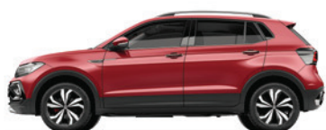
WILD CHERRY RED

GT is more than just a badge, it's a testament to the top-notch German-engineering and powerful performance of Taigun. The striking, bold design makes a statement with Chrome plaque with GT branding on the front fender, grille, and rear; GT welcome message on infotainment, Laser Red Ambient Lighting, Wild Cherry Red Stitching, Amrur Grey Classy Décor, Red Painted Caliper in Front, R17 Manila Alloy Wheels in dual tone and Dual tone leatherette seat upholstery with Red stitching.