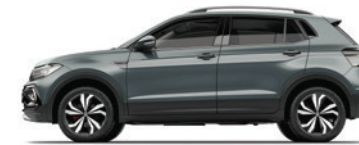
CARBON STEEL GREY