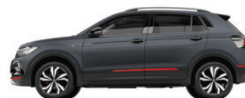
CARBON STEEL GREY MATTE