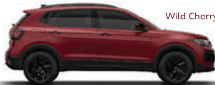
Wild Cherry Red