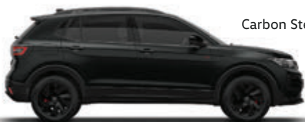
Carbon Steel Matte