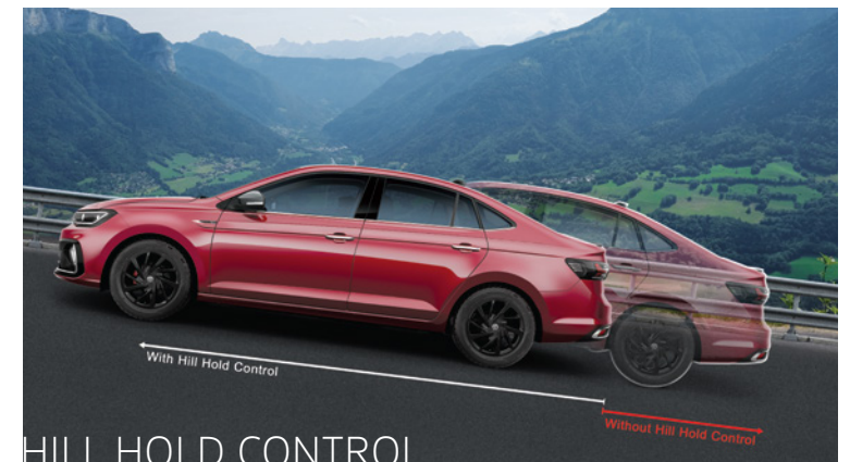
HILL HOLD CONTROL