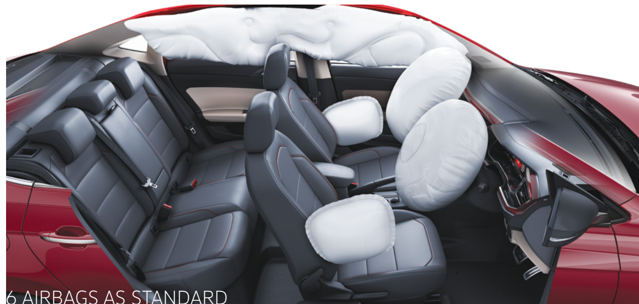
6 AIRBAGS AS STANDARD

6 airbags as standard across variants ensure safety in the event of a critical crash and Electronic Stability Control detects critical situations and prevents skidding. Park distance control and rear-view camera make parking in tight spots easy. Multi-collision brakes, and Hill Hold Control keep you in charge. While, tire pressure deflation warning, 3-head rests at rear, ISOFIX child seat anchorage, and brake disc wiping make the Virtus your partner in safety, always.