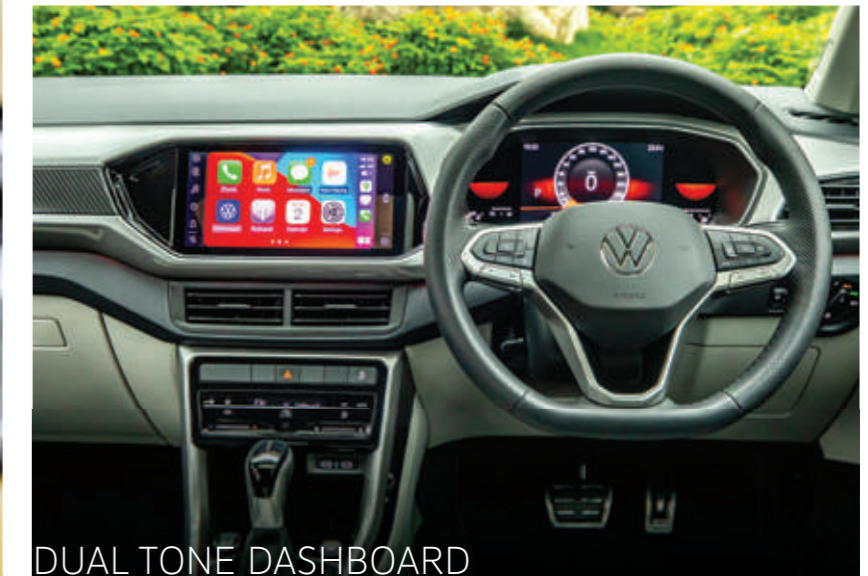
DUAL TONE DASHBOARD