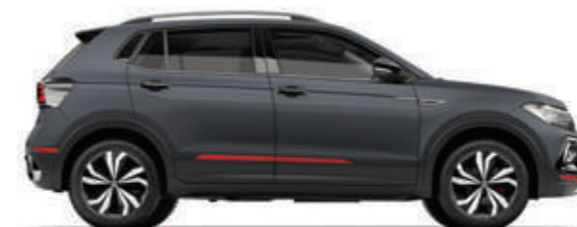
CARBON STEEL GREY MATTE

Available in both - Chrome and Sport Lines.