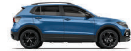
RISING BLUE METALLIC