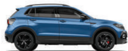
RISING BLUE METALLIC