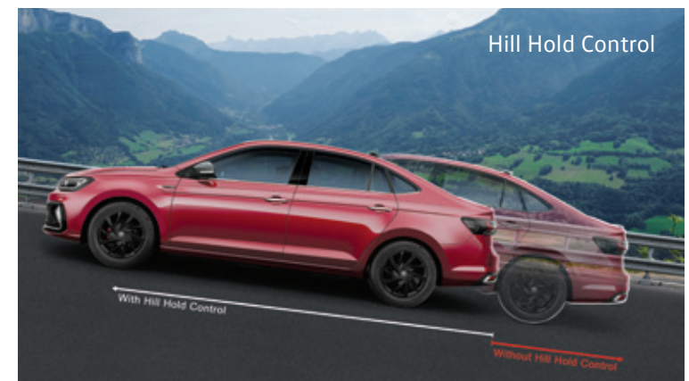
Hill Hold Control