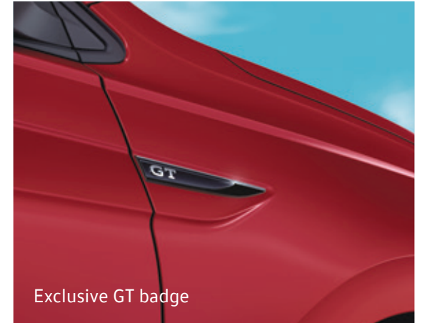
Exclusive GT badge

Feel goosebumps at every turn when you're in a Virtus. The GT badged Performance Line is powered by the revolutionary 1.5L TSI EVO engine with active cylinder management technology and boasts of 7-speed DSG transmission or a 6-speed manual transmission option. It generates 150 PS of power and 250 Nm of torque. Stunning dual-tone finish and a Carbon steel grey roof gets hearts racing. Premium aluminium pedals, red brake callipers and black boot-lid spoiler accentuate its sportiness. While 'Razor' black alloy wheels keep all eyes on you. Finally, the iconic GT badge puts a stamp on the legendary performance Volkswagen is renowned for.