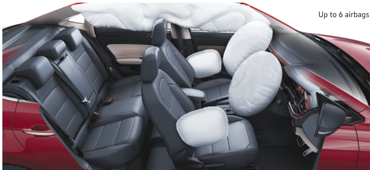
Up to 6 airbags