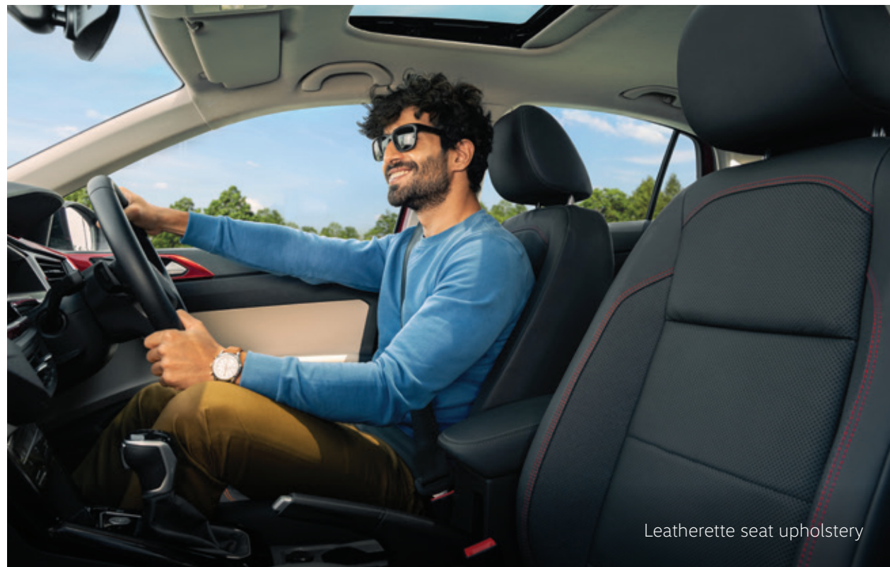
Leatherette seat upholstery

Find unmatched comfort and understated elegance, when you're in a Virtus. With a best-in-segment wheelbase* (2651 mm), the Virtus has room for everything you love. The digital cockpit and infotainment system placed in a high-gloss black 'island' at the centre exudes a touch of class. Its plush leatherette seats turn any long drive in a Virtus into a comfortable fun drive.