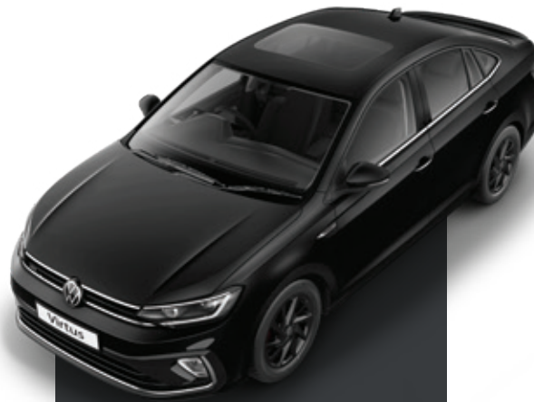
Deep Black Pearl

The clock is ticking. The units are limited. Book online now.