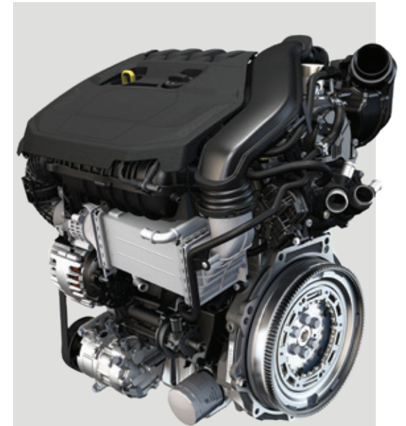
1.5L TSI EVO engine