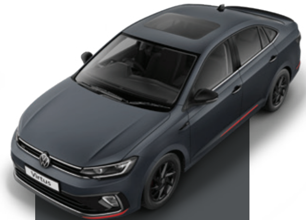
Carbon Steel Grey Matte