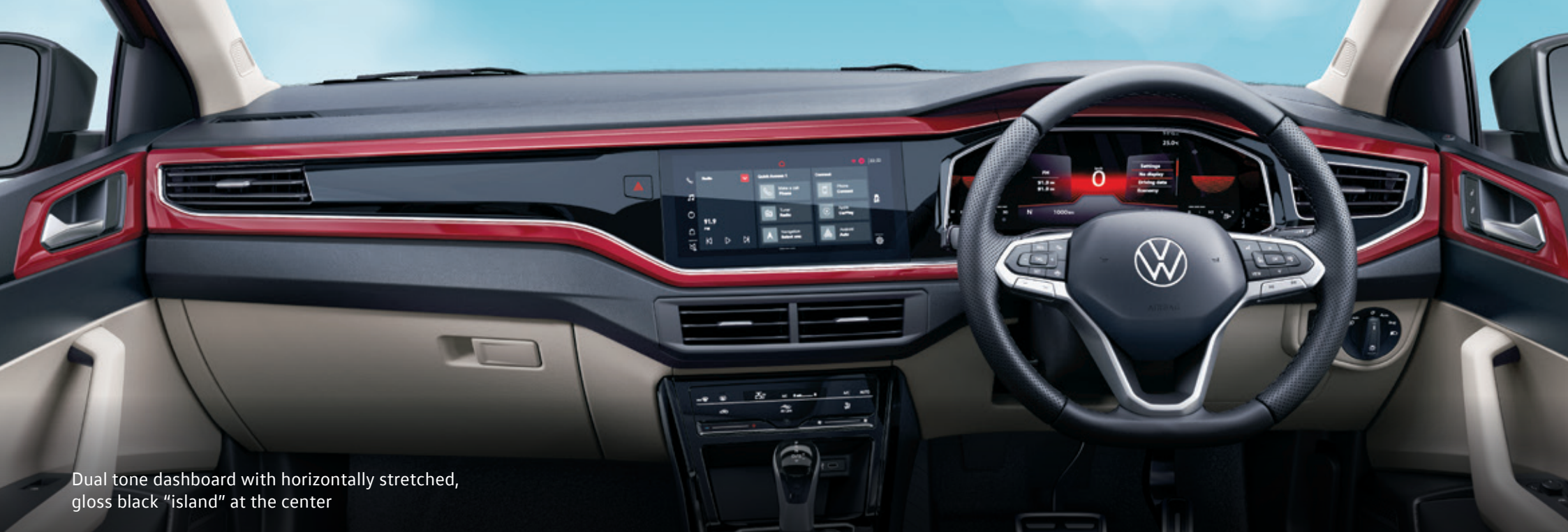
Dual tone dashboard with horizontally stretched, gloss black "island" at the center

Find unmatched comfort and understated elegance, when you're in a Virtus. With a best-in-segment wheelbase* (2651 mm), the Virtus has room for everything you love. The digital cockpit and infotainment system placed in a high-gloss black 'island' at the centre exudes a touch of class. Its plush leatherette seats turn any long drive in a Virtus into a comfortable fun drive.