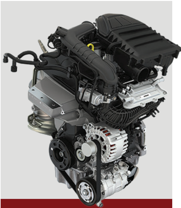
1.0L TSI engine