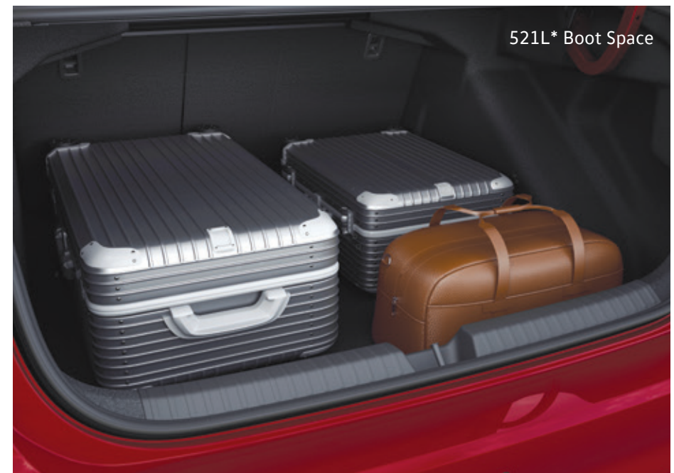
521L* Boot Space

Drives are more convenient, when you're in a Virtus. Go keyless with the smart KESSY feature. The multi-function steering wheel puts the Virtus at your fingertips. The Smart touch Climatronic AC and ventilated leatherette front seats keep you comfortable, no matter how long your definition of a long drive is. Virtus now also comes with first-in-segment electric seats for the driver and passenger that allows you to choose the best position and enjoy the drive with a flick of switch. A 60:40 split in the rear seats, along with a boot space of up to 521L*, lets you carry your world with you, just in case you feel like turning a 20 minute drive for groceries into a 2-day road trip.