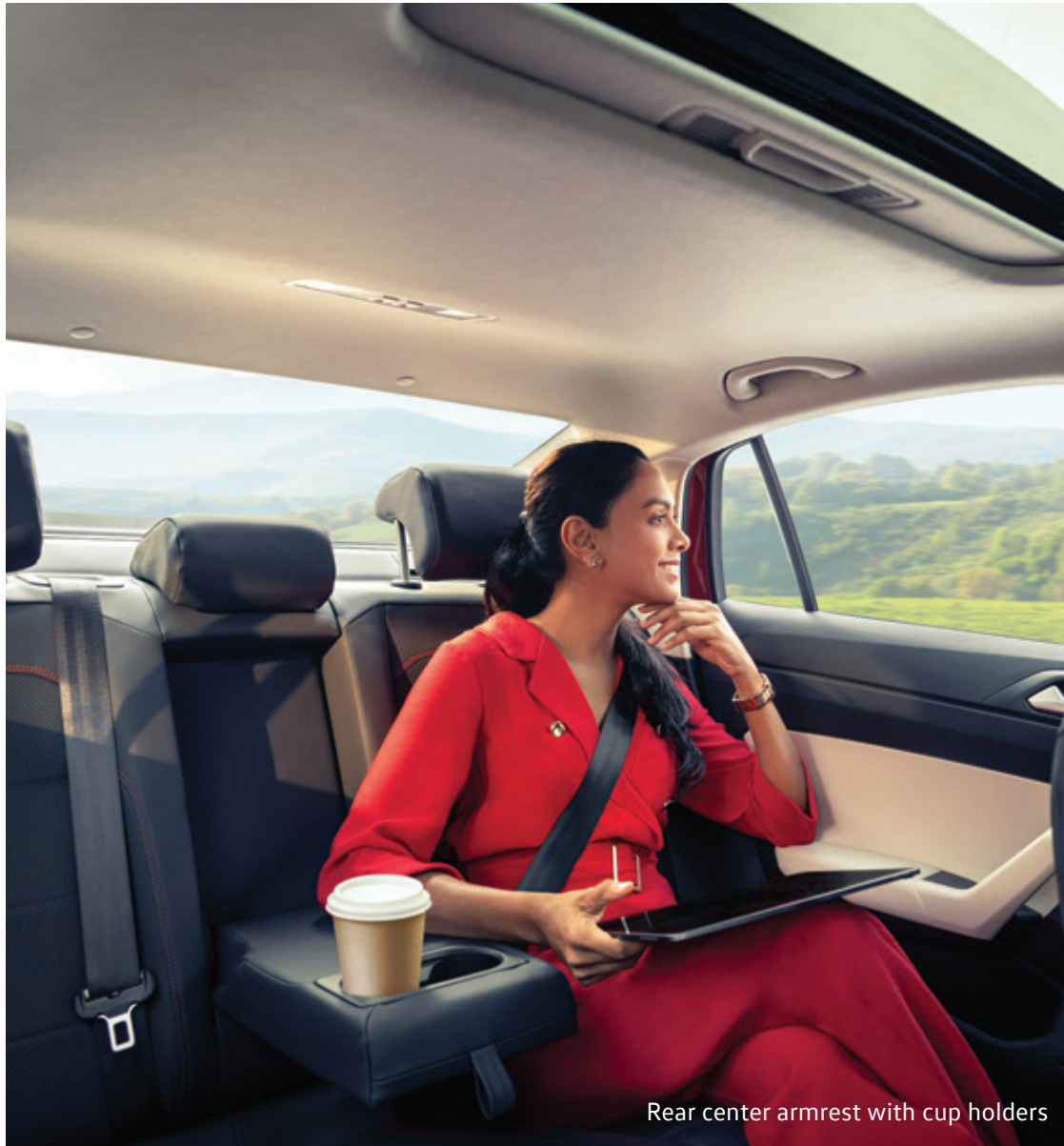
Rear center armrest with cup holders

Drives are more convenient, when you're in a Virtus. Go keyless with the smart KESSY feature. The multi-function steering wheel puts the Virtus at your fingertips. The Smart touch Climatronic AC and ventilated leatherette front seats keep you comfortable, no matter how long your definition of a long drive is. Virtus now also comes with first-in-segment electric seats for the driver and passenger that allows you to choose the best position and enjoy the drive with a flick of switch. A 60:40 split in the rear seats, along with a boot space of up to 521L*, lets you carry your world with you, just in case you feel like turning a 20 minute drive for groceries into a 2-day road trip.